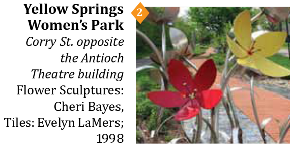
Yellow Springs Women's Park Corry St. opposite the Antioch Theatre building Flower Sculptures: Cheri Bayes, Tiles: Evelyn LaMers; 1998