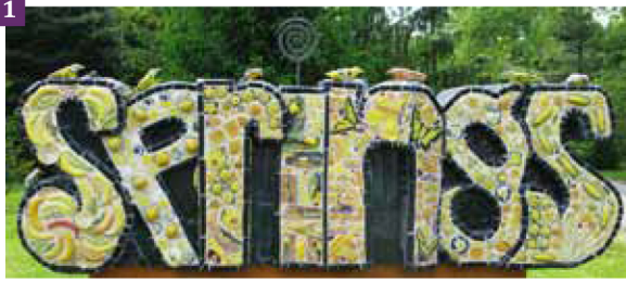
"springs" Tile Mosaic Sculpture Dayton St. and Limestone St. intersection Artist: Beth Holyoke, 2009