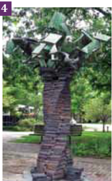
Yellow Springs Library 415 Xenia Ave. Tree of Knowledge Bronze Sculpture Artist: Jon Hudson 1992